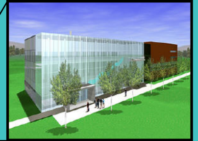
Fort Detrick NIAID Fredrick, MD