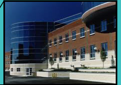
Mylan Pharmaceuticals Morgantown, WV