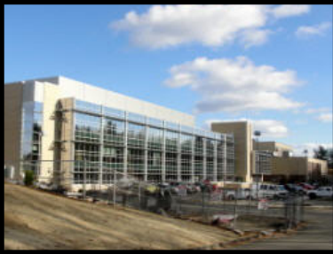
Newtown High School Sandy Hook, CT