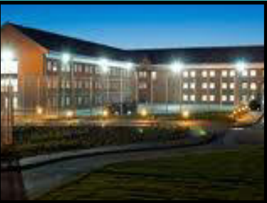
NYS Correctional Facility Malone, NY