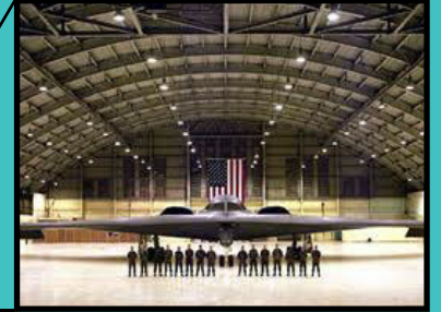
B-1 Bomber Hanger Robins AFB, GA