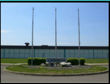
Winchester Building New Haven, CT